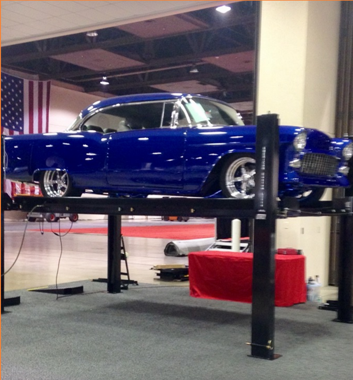
MAMMOTH S MODEL Sedan/SUV Four Post Parking Lift