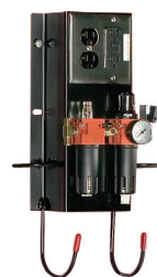
Air electric work station

2' column height extensions accommodate higher profile vehicles